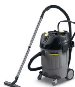
Wet & Dry Vacuum Cleaner