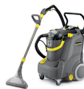
Spray Extraction Cleaner