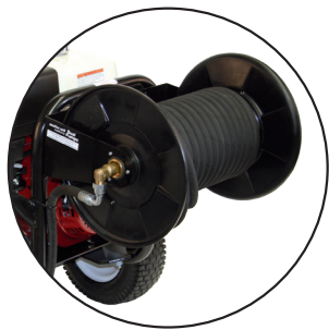
Optional 40m Hose Reel Available

For maximum performance and outstanding longevity at the heart of the Rapier petrol you will find a world leading Interpump 1450 Rpm triplex plunger pump driven via a 2:1 reduction gearbox and ultra reliable Honda engine.