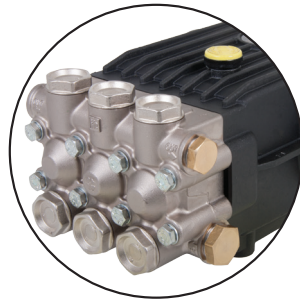
Interpump 47 Series