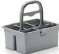
Cleaning tools box 4.035-406