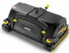
R 75 S Head 2.763-006

A large range of brushes/pads, accessories and detergents available. Please contact our customer service team on 01295 752 082 to order.