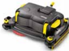
D 75 S Head 2.763-005