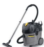
Wet & Dry Vacuum Cleaner