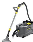
Spray Extraction Cleaner